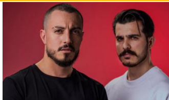
Azerbaijan FAHREE feat. Ilkin Dovlatov - Özünle Apar